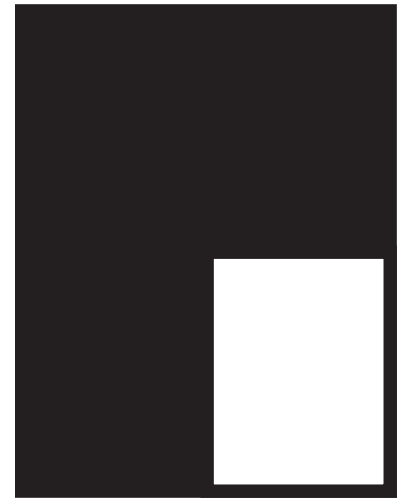
QUARTER PAGE 3.65" x 4.875"