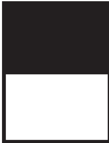
HALF PAGE 7.5" X 4.875"